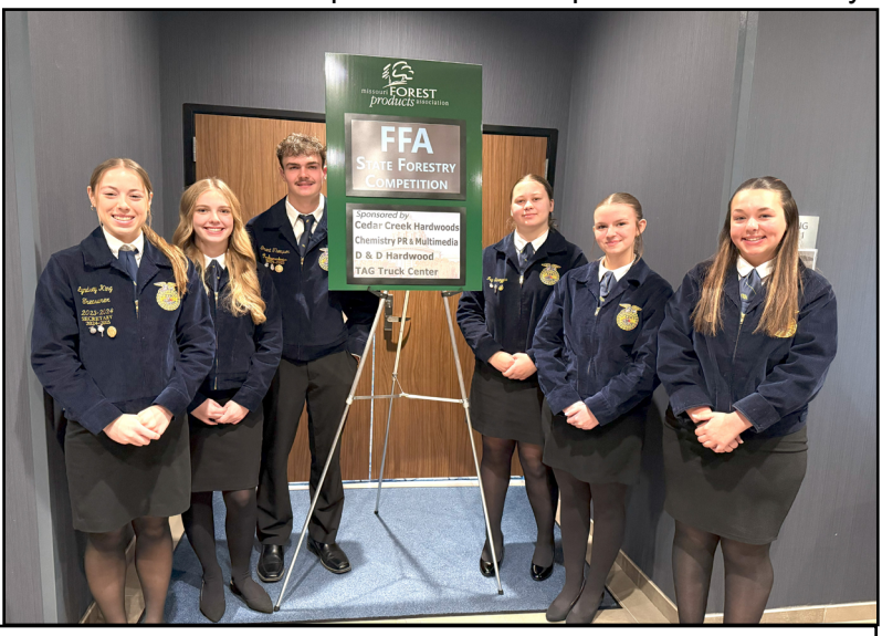
FFA Students in the State Forestry Public Speaking Competition

MFPA will be reaching out to MFPA members to serve as judges in next year's District and State level competitions. If you are able to help judge next year's district competition in your area, let us know by calling the MFPA office at 573-634-3252. or emailing laura@moforest.org.